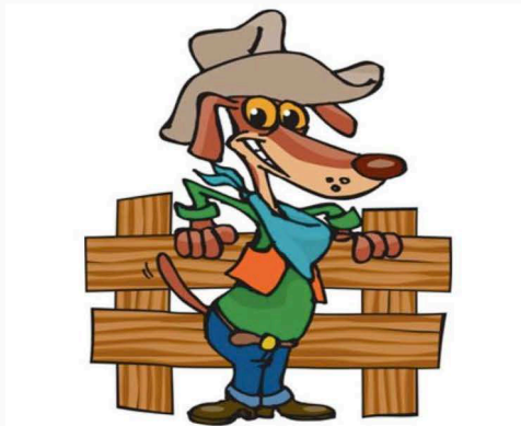
Western Doggie Roundup

to the Western Doggie Roundup November 4th, 5th and 6th