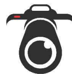
PHOTO SHOOT séance photo

September 29th, 2023 9:30AM - 12:00 noon